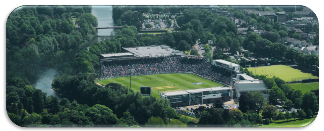
Amber Lounge, Sophia Gardens